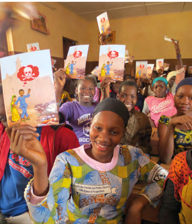
Mine risk education session in a school in Mopti, Mali.

The organization carries out clearance operations and is engaged in the disposal of explosive remnants of war (ERW), conducts community safety and security programs, and deploys all activities related to victim assistance; from referral to rehabilitation, education and socio – economic inclusion. We work alongside authorities and incite them to take responsibility in all spheres of Mine Action. Our advocacy work at the national and international level is directly grounded in our field experience. Handicap International is the only non-governmental organisation that covers victim assistance alongside clearance, risk education and advocacy in as many countries.