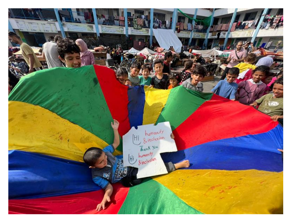
HI team and volunteers conducted recreational activity sessions, in Khan Younis UNRWA DES shelters, Gaza, October 2023.

Humanitarian actors should systematically consider these four must-do actions to promote inclusion in their work at global, national, and subnational levels.